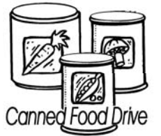
Canned Food Drive

The CARE Center at the First Baptist Church is in need of canned goods and sugar and flour, to help out local residents. They are currently helping 45 families in our East Bernard area. Please take the food items to the First Baptist Church. Thank you!